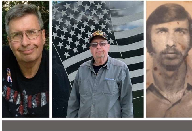
B&W photo from New York gun permit from 1973